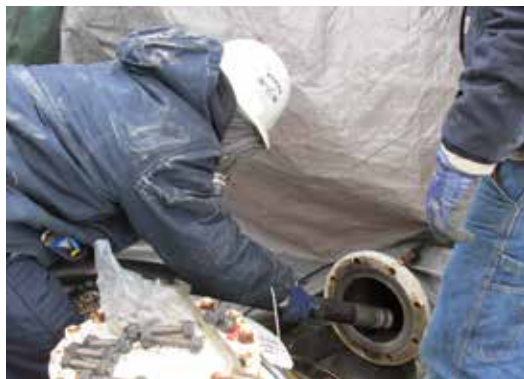
Power and Process Piping