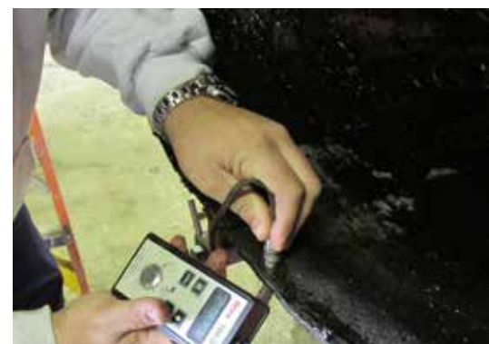
Quality Control Systems

Plaas Incorporated Industrial Services is a Mechanical Piping Contractor focusing on new construction, scheduled maintenance, outages, emergency repair work, NBIC repairs and alterations, ASME code work for power piping boilers and pressure vessels, design and development of ammonia refrigeration systems, Confined Space Rescue Services and Quality Control Systems.